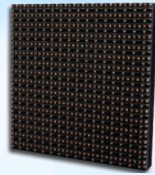
.62 sq ft Building Block

The FLEX-V FULL COLOR Series is designed and built to grow with your organization. All our available pitches from 5mm to 24mm fit into one universal module size .