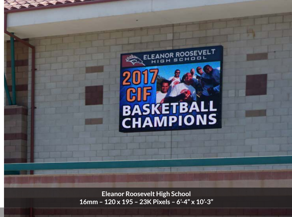
Eleanor Roosevelt High School 16mm – 120 x 195 – 23K Pixels – 6'-4" x 10'-3"